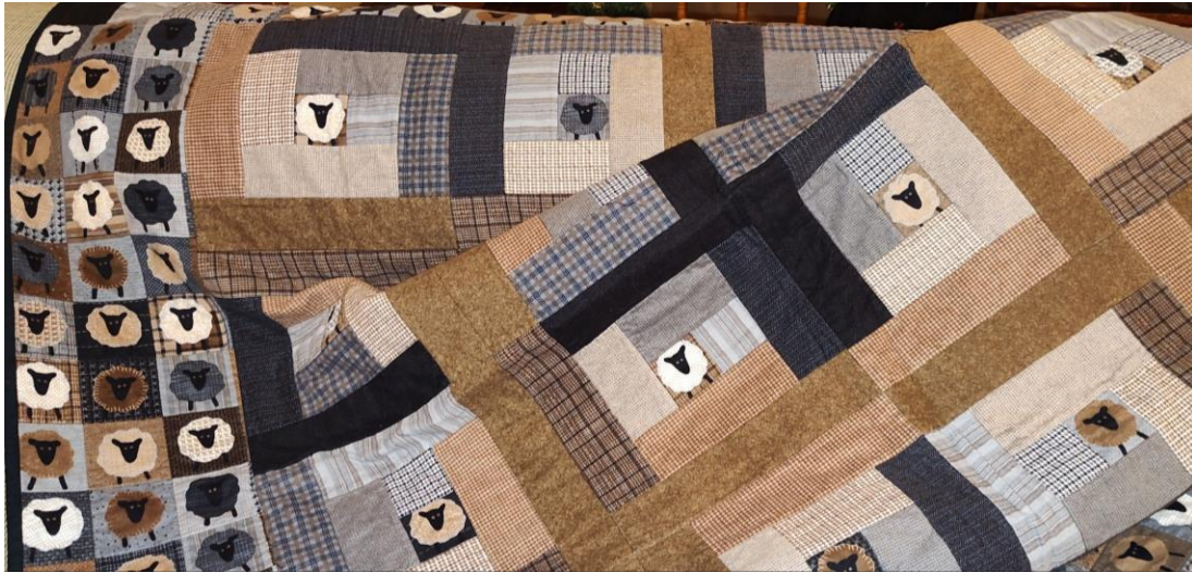
(Quilt: We Are the Sheep of His Pasture)

Dear Friends in Christ—quilters, crafters, woodworkers, and those who love all things handcrafted